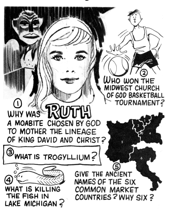
See page six for answers